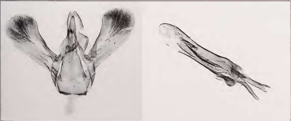
Fig. 4. Titanio caradjae (Rebel, 1902) comb. n. , ♂ genitalia (GU Kallies 156-96).